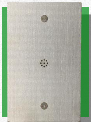
The SS-807 Microphone

Interview recordings will show proper procedures were followed, which can prevent allegations of false confessions or officer misconduct.